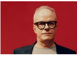
Hans Ulrich Obrist Switzerland & the UK Artistic Director of the Serpentine Galleries