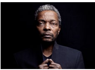
Simon Njami Cameroon & Switzerland Writer, curator, essayist and art critic